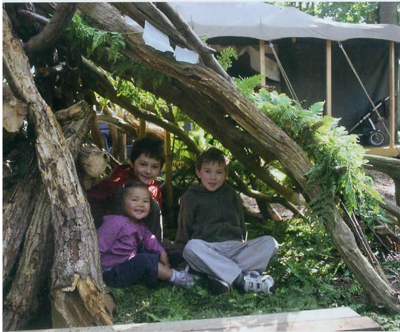
Previous page: 'glamping' tents at Jollydays. Above: indoors and out, kids are happy to make their own entertainment at Jollydays.