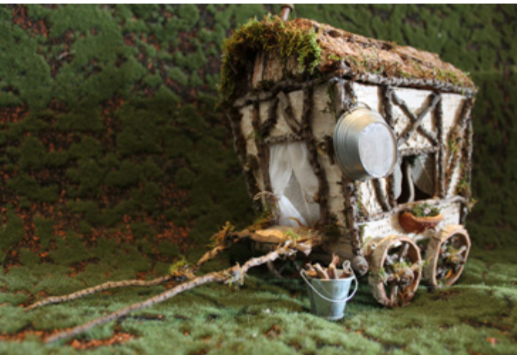
Early 19th century fairy caravan.