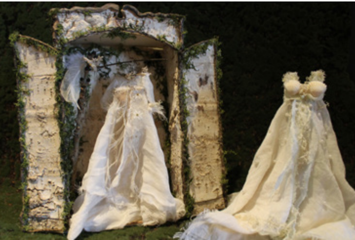
Well preserved fairy wardrobe and dresses spun from spider silk.