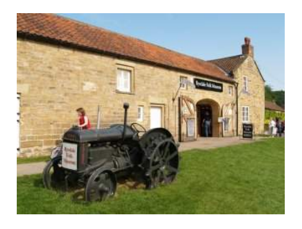
Approximately 40 minutes from the campsite

Their atmospheric buildings and collections, spread over six acres, tell a story about a rural way of life from the Iron Age to the 1950s. So go and explore their friendly museum and enjoy a great day out for all the family!