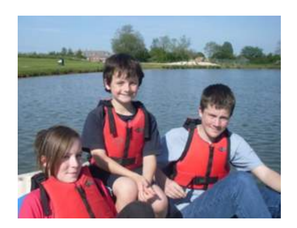
They offer a variety of watersports and Lakeside cafe.

For a fun family day out visit the water-sports activity centre. Everyday activities include pedalos, kayaks and canoes which are suitable for all ages, no experience is required and all safety equipment is provided. If you would like to learn to sail or windsurf they offer taster sessions and courses with qualified instructors. The younger children can join mum and dad on the water, visit the play-park and pet corner or explore the many footpaths surrounding the lakes.