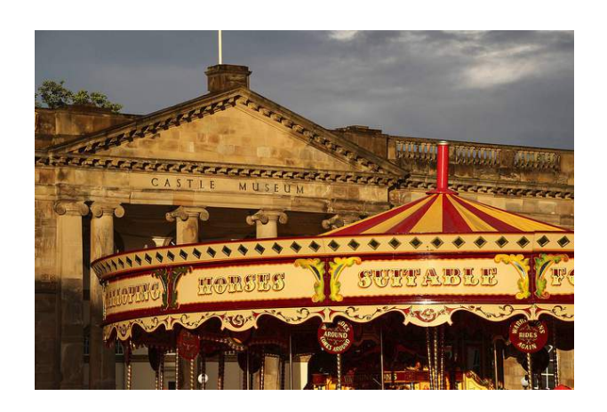
Approximately 30 minutes from the campsite

It displays thousands of household objects and by recreating rooms, shops, streets and even prison cells. The museum, which opened in 1938, was named after the former York Castle, which stood on the site. It displays thousands of household objects and by recreating rooms, shops, streets and even prison cells. It is best known for its recreated Victorian street, which combines real shop fittings and stock with modern sound and light effects, to evoke an atmosphere of Victorian Britain.