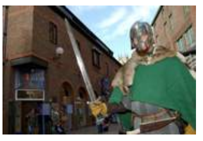
This is a world famous attraction and the queues can be legendary! A fascinating glimpse into Yorks history.

Take hold of the past and explore the excavations which first unearthed the Viking-age city in their brand new exhibitions.