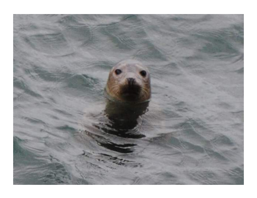
\label{prop:prop:constraint} V is it $$ www.yorkshire.com/places/yorkshire-coast/flamborough $$