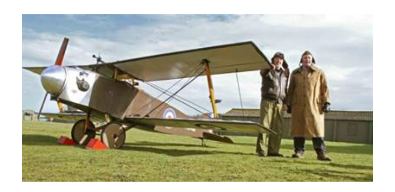
Just 15 minutes from our campsite

Visit their website www.yorkshireairmuseum.co.uk Contact - 01904 608595