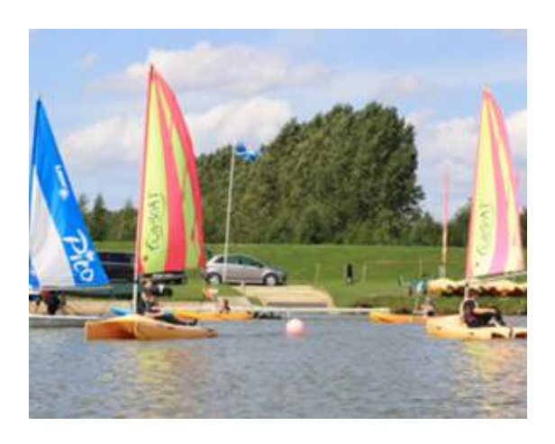
Approximately 30 minutes from the campsite

The Lakeside Café serves delicious breakfasts, lunches, cakes and scones which are home-made on the premises; much of the ingredients are locally sourced wherever possible.